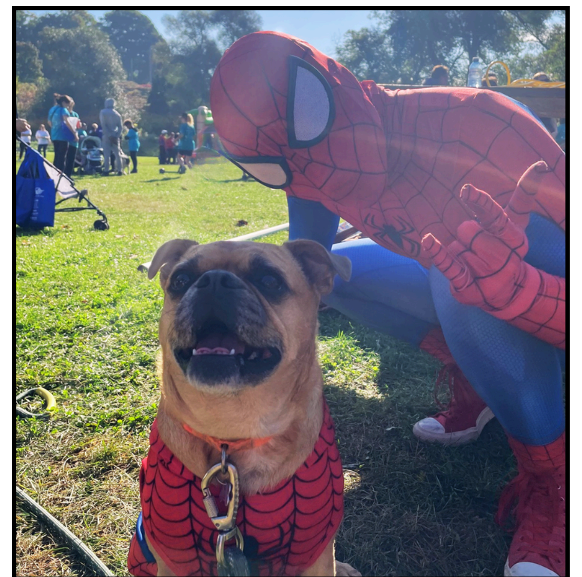
Who wore the Spider-Man Suit better?