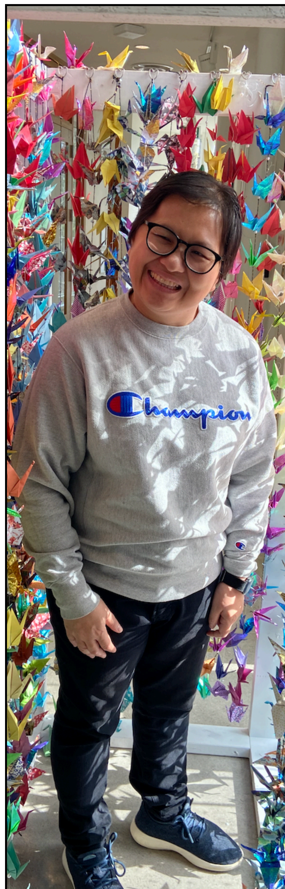
A BIST Member stands in our 'Master Crane Operator' Installation at the Clark Centre