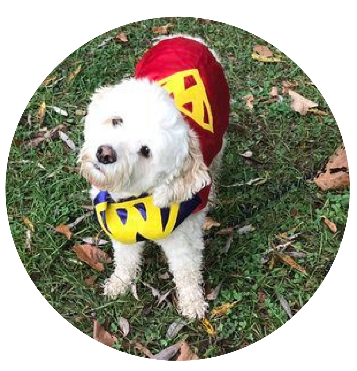
The cutest HERO DOGS in town come to our event!