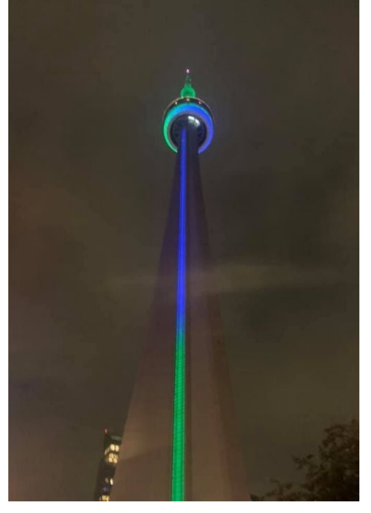
The CN Tower lit green and blue for Brain Injury Awareness Month, June 2023.

• LAUNCHED IN PERSON PROGRAMS! We currently offer a mix of ONLINE and IN PERSON programs to meet the accessibility needs of our members - including IN PERSON and ONLINE support groups, workshops and FREE Community Outings.